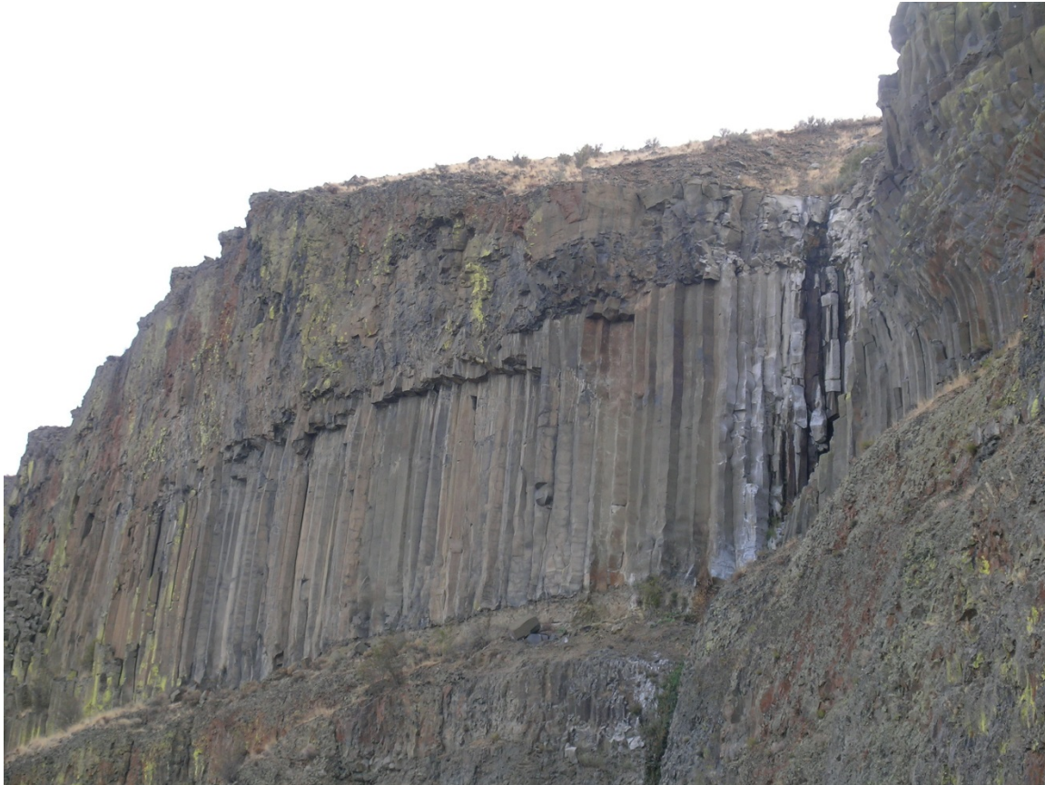
Figure 3.4. The Columbia River Basalt flows showing the colonnade and entablature at Banks Lake, upper Grand Coulee.

flows are now believed to have introduced significant amounts of aerosols into the upper atmosphere, partly by local explosive volcanism... 53 The idea that the CRBs were post-Flood 54 seemed reasonable at the time. This is when I knew very little about geology. After examining the geology of the Pacific Northwest, I became convinced the CRBs were deposited within the Flood. 45 This was an important turning point. I will step you through my research of the CRBs in Chapter 37.