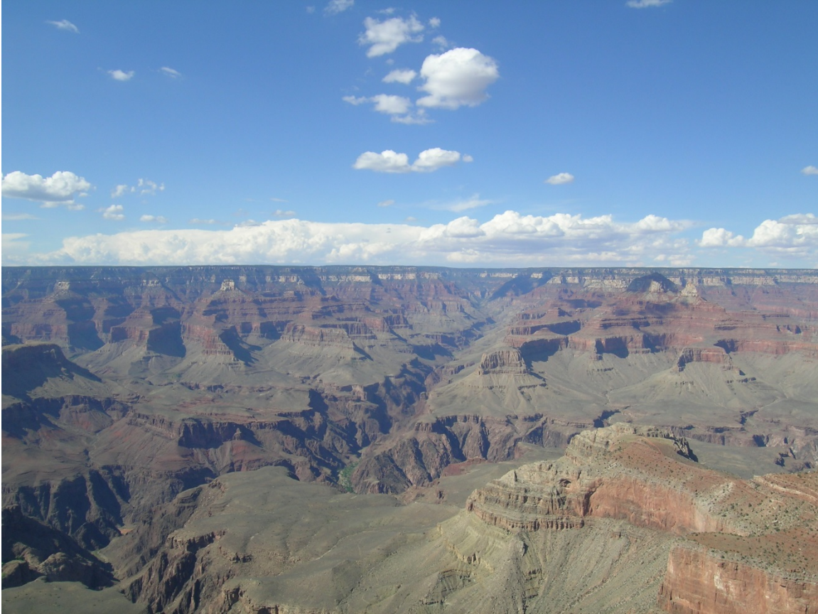
Figure 3.1. Grand Canyon (view north from Yavapai Observation Station).